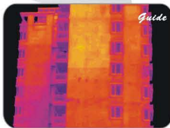
Inspect building structure