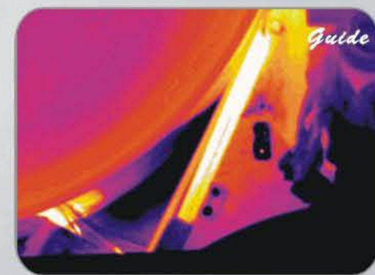
Evaluate equipment operating