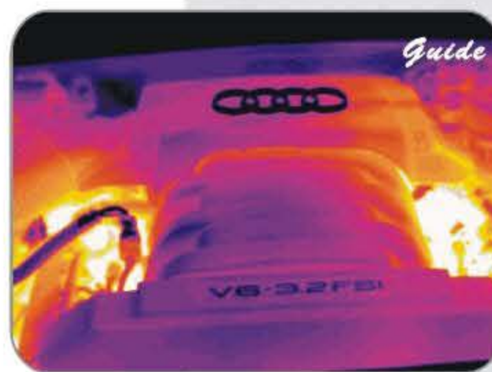
Monitoring and analysis heat distribution