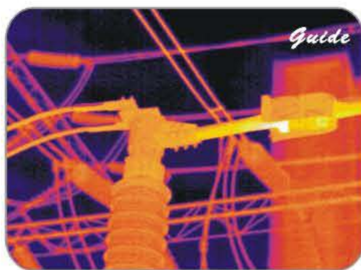
Inspect electricity hot point